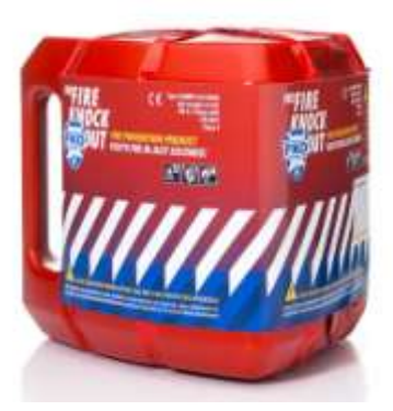
Figure 1.2 Fire Knock Out 5.6 Model

The Fire Knock Out (FKO) has a special feature: it automatically starts to operate when it comes into contact with open fire and then fights the seat of a fire within a few seconds. The plastic container is filled with a harmless fire extinguishing fluid and activation (powder) material, on which a quick fuse is fitted.