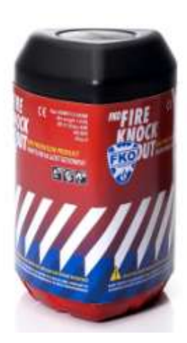
Figure 1.1 Fire Knock Out 1.6 Model

The Fire Knock Out is supplied in various versions and models. The most common version is based on a foam basis and suitable for fighting Class A fires (solids, usually of organic origin, in general with a glow development), Class B fires (fluids or substances becoming fluid) and Class C (gaseous) fires. Almost all versions can be used in closed areas and with outside fires.