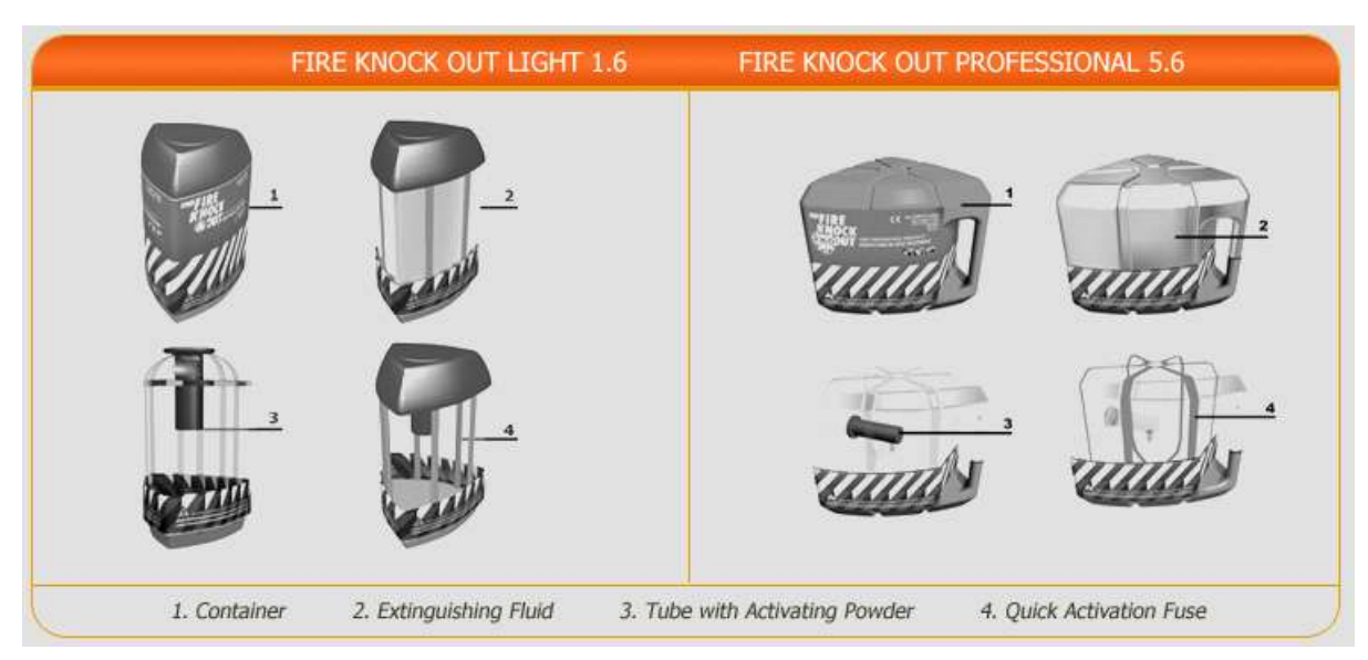
Figure 3.1 Table of contents within Fire Knock Out