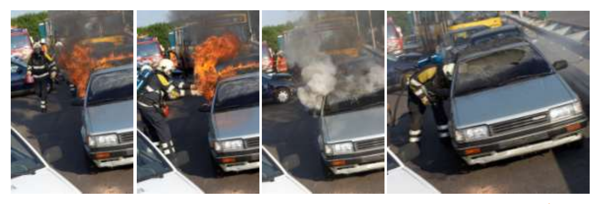
Figure 5.1 A Fireman extinguishes a car fire with the Fire Knock Out 5.6 model (Active Usage)

When a fire occurs in a non-protected area, The FKO can be thrown or rolled (in a controlled manner) into the fire from a safe distance. Entering an area in which a fire has taken place is very dangerous and difficult; FKO can be thrown without having to enter the area. When the FKO gets thrown or rolled into the flames, it will activate by itself without any more human intervention. The FKO is easy to carry. Due to this characteristic, the reaction time to fight a fire is significantly shortened, limiting the risk of a fire causing greater damage.